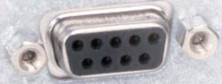
RS232 standard on all GP, AP, and APS models/sizes

Heratherm incubators offer superior data monitoring systems that provide the key to reliable results.