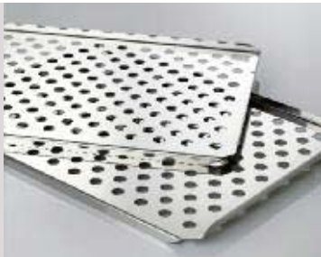
Stainless steel perforated shelves