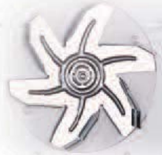
Two speed fan for matching the airflow to your application