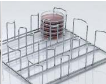
Petri dish holder