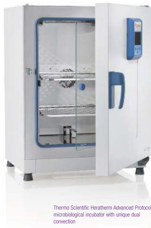
Thermo Scientific Heratherm Advanced Protocol microbiological incubator with unique dual convection