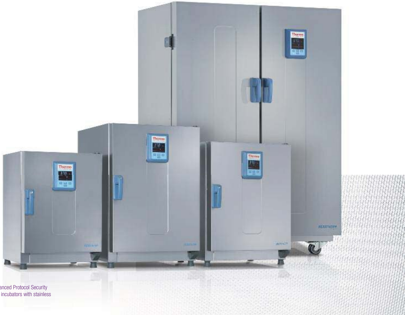
Heratherm Advanced Protocol Security microbiological incubators with stainless steel exterior

An optional stainless steel exterior is available for the Advanced Protocol and Advanced Protocol Security models.