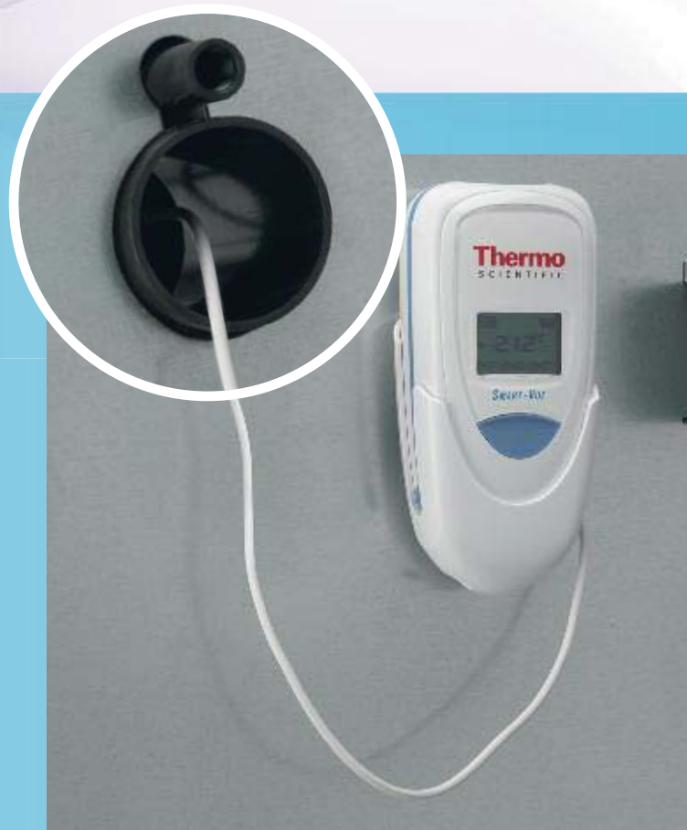
Rear view of the 100 L Advanced Protocol oven with Smart-Vue

Solutions vary by RF regions worldwide and are compatible with multiple brands and types of laboratory equipment. Contact your local sales representative for more details.