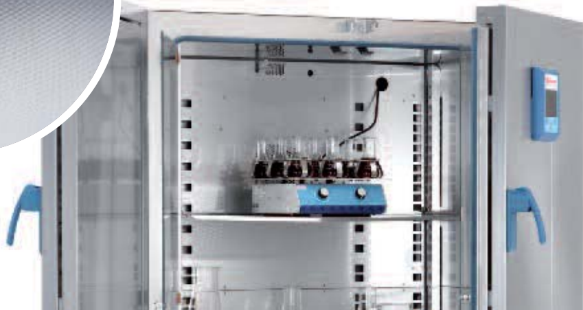
Access port for independent sensor or use of shaker / stirrer inside the unit