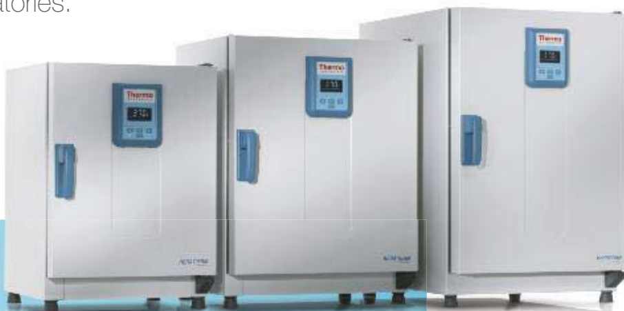
Heratherm General Protocol Ovens, 60 L, 100 L, 180 L models

Designed for routine applications in pharmaceutical, medical, food and research laboratories.