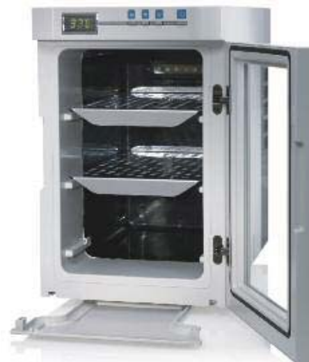
Heratherm Compact microbiological incubator, 18L