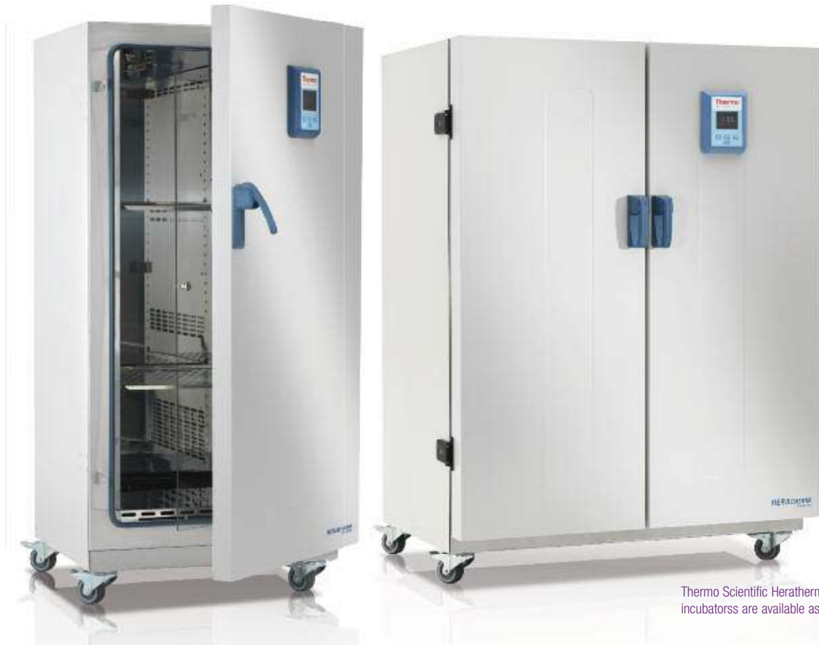
Thermo Scientific Heratherm large capacity incubators are available as 400 L and 750 L units.

Designed with your need for high sample volume or larger samples in mind.