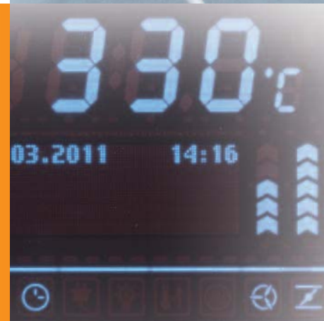
Operating temperatures as high as 330 °C