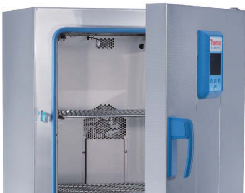
100 L model shown

As well as incorporating all the benefits of our General Protocol table top ovens, the Advanced Protocol range boasts additional features providing even more flexibility, accuracy and dependability.