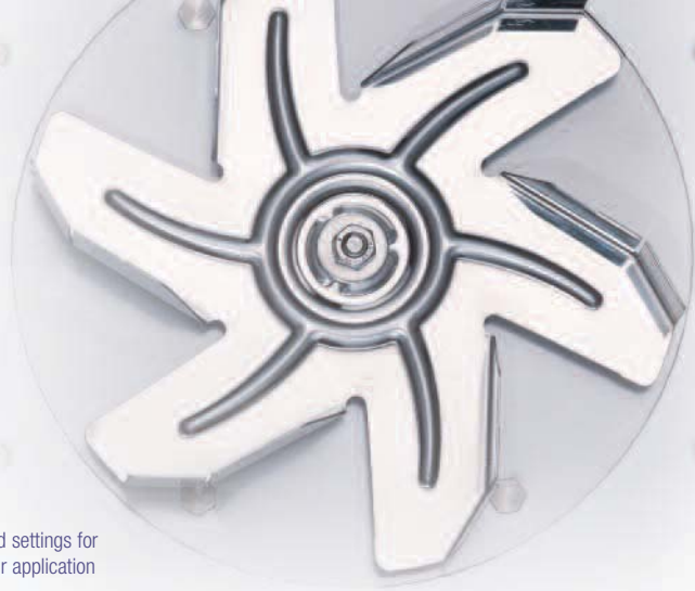
Fan adjustable in five speed settings for matching the airflow to your application