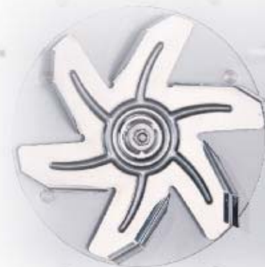
Fan adjustable in two speeds for matching the airflow to your application