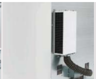
Fresh air particle Filter