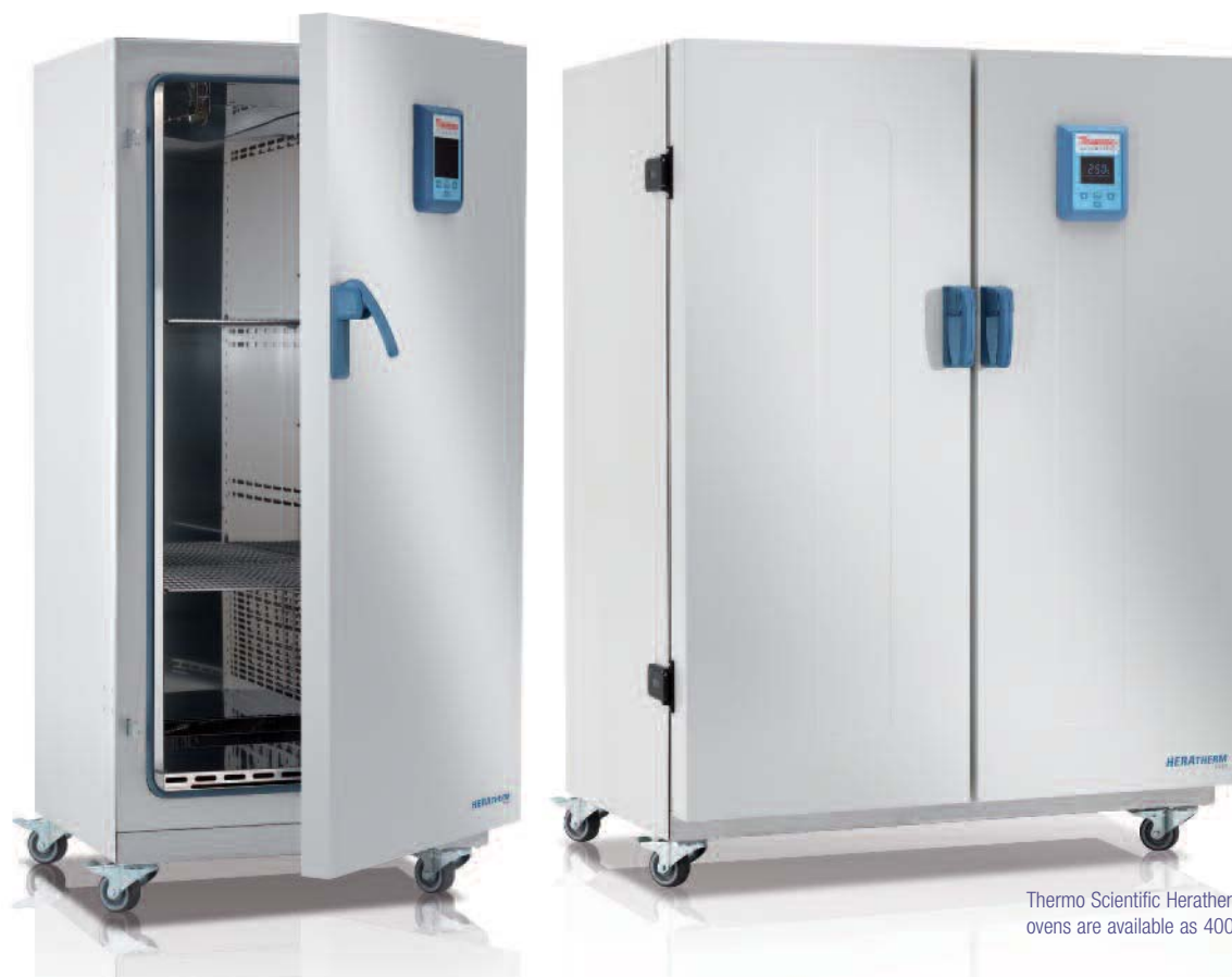
Thermo Scientific Heratherm large capacity ovens are available as 400 L and 750 L units

Heratherm large capacity ovens have been designed with your need for larger samples or high sample volume in mind. The General Protocol ovens provide high capacity for your day-to-day drying and heating applications.