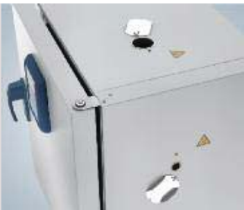
Access port top and right

Please ask for our special solutions. We can provide Heratherm tabletop ovens for cable testing applications, clean room applications, and inner casing with conditional gas-tightness for inert gas applications. We can provide additional access ports for the large capacity ovens at your preferred position, on demand.