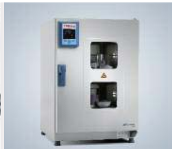
Viewing windows in 180L unit