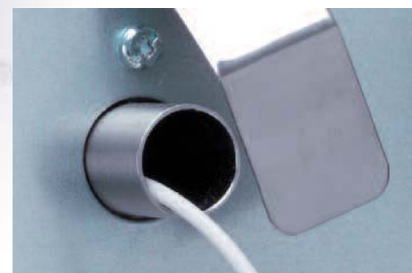
Dedicated access port (18 mm in diameter) allows the introduction of independent sensors