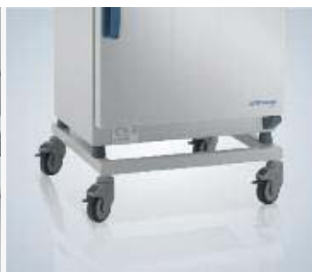
Support stand with casters