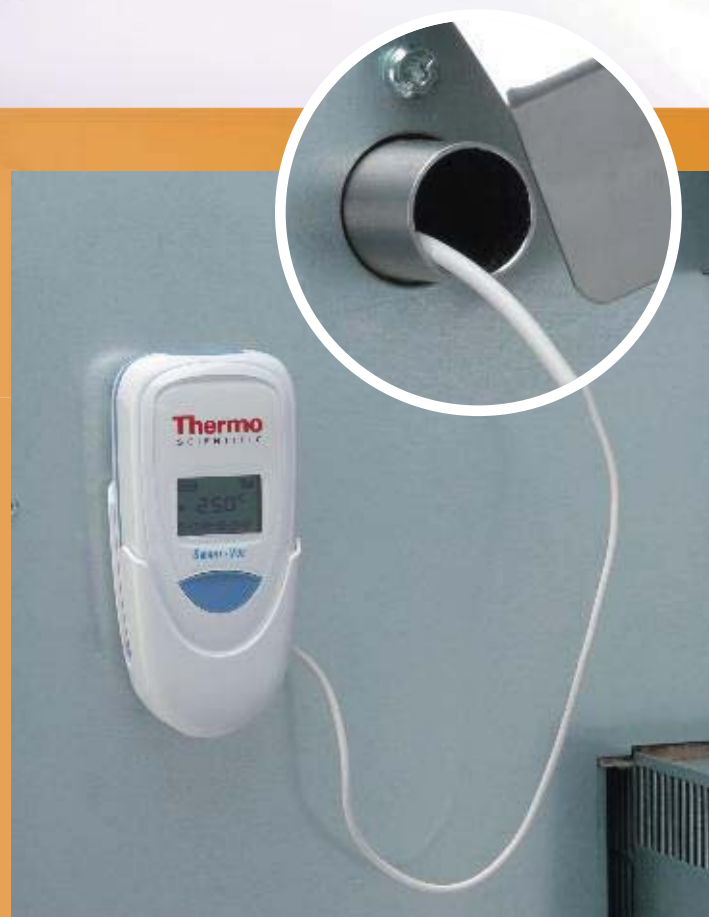
Rear view of the 100 L Advanced Protocol oven with Smart-View

Solutions vary by RF regions worldwide and are compatible with multiple brands and types of laboratory equipment. Contact your local sales representative for more details.