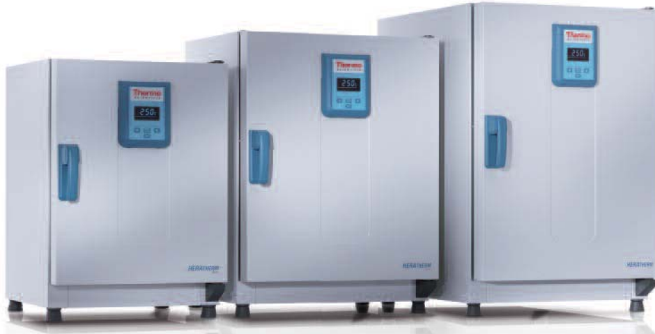
60 L, 100 L, 180 L models shown

Heratherm ovens have a smooth inner casing with easy to clean rounded corners