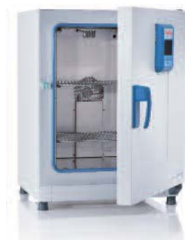
All Heratherm Advanced Protocol Security ovens are available in coated or stainless steel exterior. (model 100)