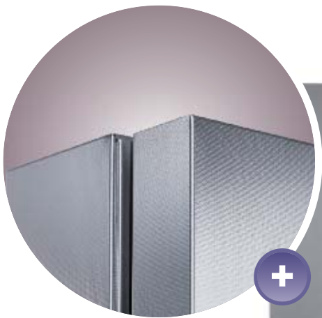
Advanced protocol units available in stainless steel exterior