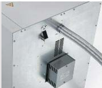
Underbench installation kit