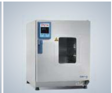
Viewing window in 100L unit